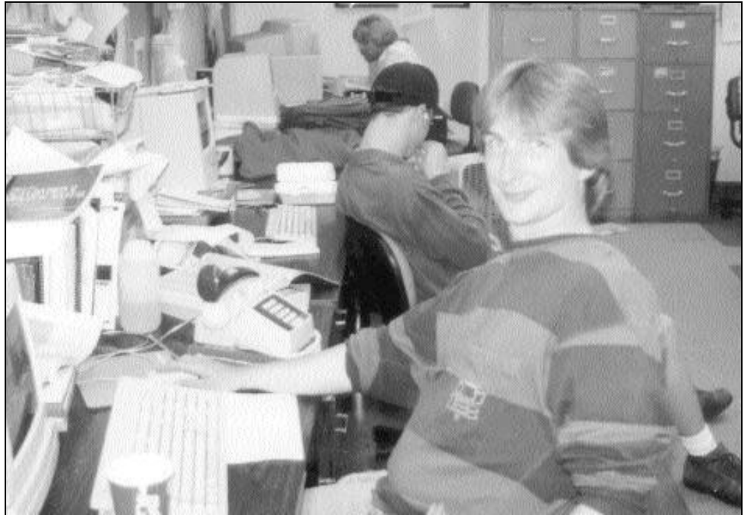
The Anchorage Times

When the Exmos' performance was compared to that of another member of the Original Six, Baltimore's "30-point Wonders" of 1996,