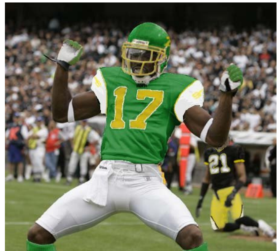
Anchorage receiver Braylon Edwards celebrates one of his two touchdowns against Hogtown